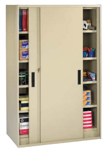
Sliding Doors are an ideal solution for narrow spaces. Available in our traditional storage Jumbo Cabinet.