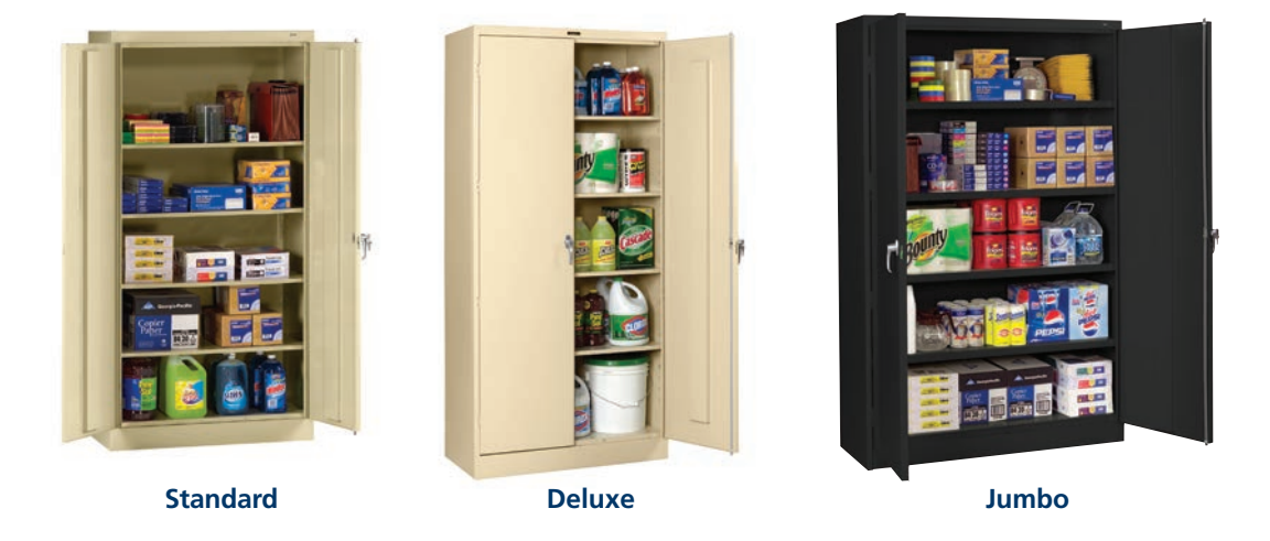
We've got the right size for you, with widths from 30" to 48", depths from 15" to 24" and heights from 30" to 78"