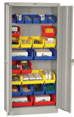
Bin boxes sold separately by other suppliers.